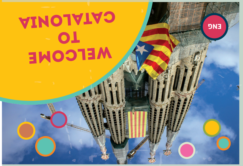
Cover photo ©Jordi Pagès-Joana Triviño